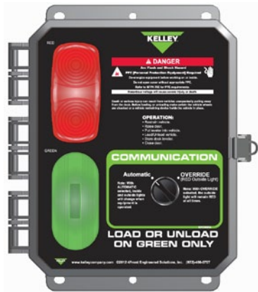
Automatic Light System (ALS) Auto Activation