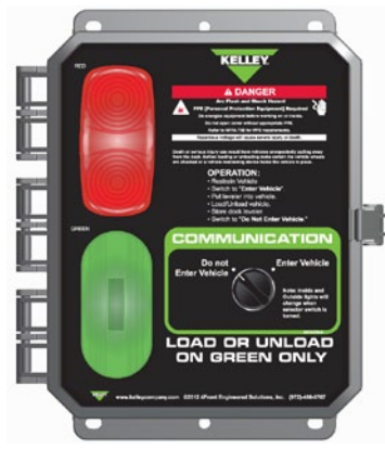
Manual Light System (MLS) Manual Activation